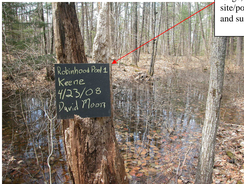
Example of photo of survey site/pond

Include the name and location (GPS coordinate, or township, range, and section) of survey site/pond, county, date of survey, and surveyor name in the photo